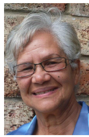
Lillian Stoffels Biblioteek