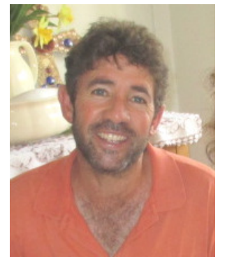
Buks Prinsloo Adventurer Club